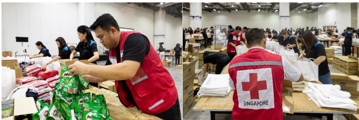
Volunteers from benefitting organisations including Singapore Red Cross joined Marina Bay Sands for the annual Sands Cares Food Kit Build