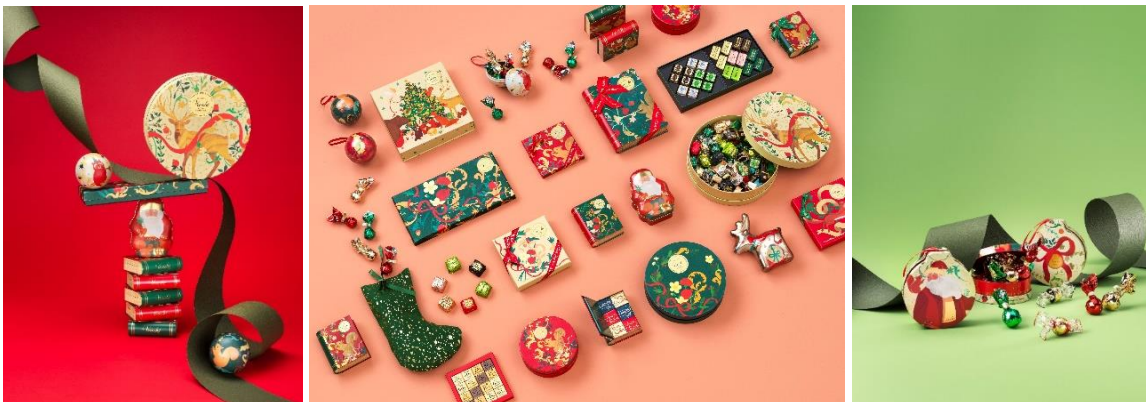
Venchi's new Christmas collection creates an atmosphere of magic by depicting a fairytale world.

Heritage Moroccan brand Bacha Coffee is spicing up Christmas with a selection of exquisitely crafted products such as the limited-edition Coffee Journey Gift Box (S$78) designed by renowned French-Moroccan artist Mehdi Qotbi. Make this year's festivities a memorable one for coffee gourmands by gifting them this unique piece of art, which is a special collaboration limited to 3,000 serialised gift boxes. The brand's commitment to form and function also comes to the fore in another striking collaboration – Bacha Coffee X Alessi La Conica Espresso Pot (S$450). The Moroccan marque's gift selection for coffee connoisseurs ranges from the meticulously curated Winter Spice Coffee Hamper (S$360) to exquisite hand poured candles (S$55/140g, S$85/250g).