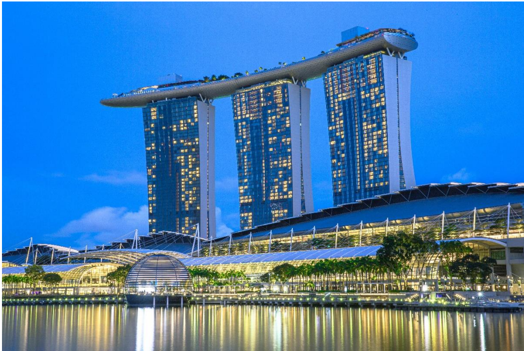
Marina Bay Sands' The Holiday Light Up will be happening on 18 November, Friday, at 7.30pm at The Shoppes.

Revel in the festive spirit with The Holiday Light Up, gifting ideas, festive specials, entertainment and more