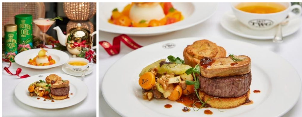
TWG Tea's Festive Set Menu starts from S$59++, available from 28 November to 30 December.

Celebrate the festive cheer with a contemporary Asian 5-course Christmas menu at CÉ LA VI restaurant while soaking in mesmerising views of the city skyline. Choose from dining delights such as Irish Premium Oyster , which features the robust flavour of Nomad kaluga hybrid caviar intertwined with tangy ponzu, or Zucchini Flower , a dish well complemented by rich and fiery yuzu kosho and refreshing green apple, to kick off your Christmas meal. The special menu also includes savoury Truffle & Maitake Chawanmushi and the signature A4 Miyzaki Wagyu Striploin . The Christmas menu is only available on 24 and 25 December, at S$198++ per person.