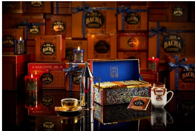
Bacha Coffee's Bacha Coffee X Alessi La Conica Espresso Pot and Limited Edition Coffee Journey Gift Box