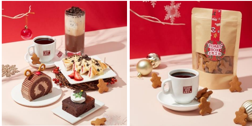
(From L to R) Toast Box's festive promotion includes the Christmas slice cake or toast with a hot beverage, Mini Gingerbread Man Cookies.

with a refreshing orange sorbet and a Forever Noel Tea-infused tuile. Available from 28 November to 30 December, diners can choose either the two- or three-course menu starting from S$59++.