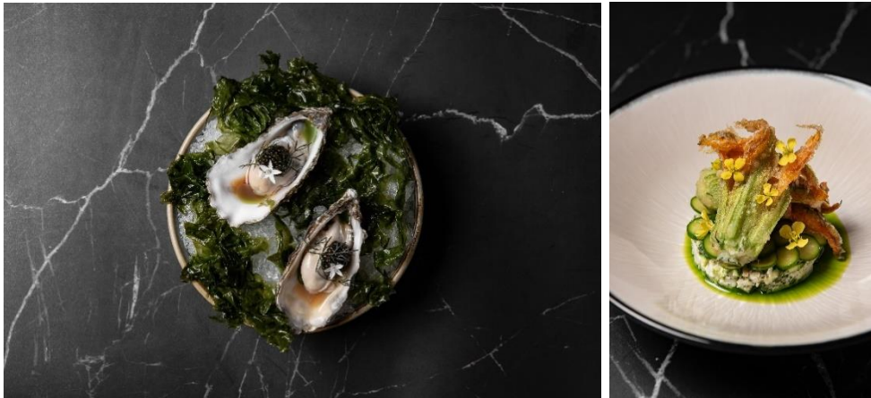
(From L to R) CÉ LA VI's 5-course Christmas Menu, which is only available on 24 and 25 December, showcases Irish Premium Oyster and Zucchini Flower.

Celebrate the festive cheer with a contemporary Asian 5-course Christmas menu at CÉ LA VI restaurant while soaking in mesmerising views of the city skyline. Choose from dining delights such as Irish Premium Oyster , which features the robust flavour of Nomad kaluga hybrid caviar intertwined with tangy ponzu, or Zucchini Flower , a dish well complemented by rich and fiery yuzu kosho and refreshing green apple, to kick off your Christmas meal. The special menu also includes savoury Truffle & Maitake Chawanmushi and the signature A4 Miyzaki Wagyu Striploin . The Christmas menu is only available on 24 and 25 December, at S$198++ per person.