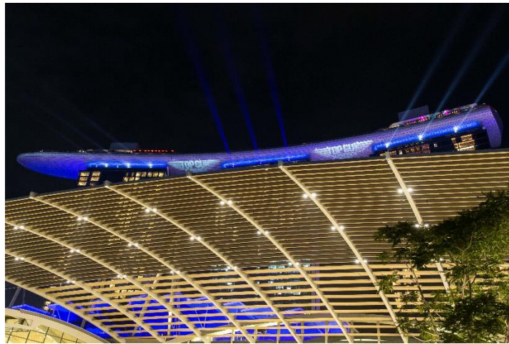
The underbelly of Sands SkyPark illuminated with the Top Gun: Maverick logo

up the Marina Bay area. It was also the first such event to be staged at Marina Bay Sands since the Covid-19 pandemic.