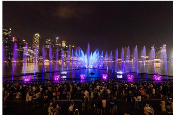
From L-R: Images from Top Gun: Maverick were projected onto water screens; a kaleidoscope of colours lit up the skyline as part of the show

Top Gun: Maverick – A Light, Water & Pyrotechnic Extravaganza was a 10-minute, state-of-the-art multimedia showcase that adapted Spectra, its nightly light and water show, for a special rendition that incorporated state-of-the-art lasers, lights and dynamic water effects with electrifying projections of scenes from the sequel. This visual display was set to the stirring Top Gun: Maverick soundtrack – from the iconic instrumental rock theme song to Lady Gaga’s new single “Hold My Hand”, a soaring anthem specially composed for the film.