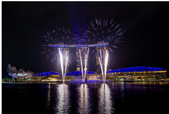
View of Top Gun: Maverick Light, Water & Pyrotechnic Extravaganza from Fullerton Bay

Top Gun: Maverick – A Light, Water & Pyrotechnic Extravaganza was a 10-minute, state-of-the-art multimedia showcase that adapted Spectra, its nightly light and water show, for a special rendition that incorporated state-of-the-art lasers, lights and dynamic water effects with electrifying projections of scenes from the sequel. This visual display was set to the stirring Top Gun: Maverick soundtrack – from the iconic instrumental rock theme song to Lady Gaga’s new single “Hold My Hand”, a soaring anthem specially composed for the film.