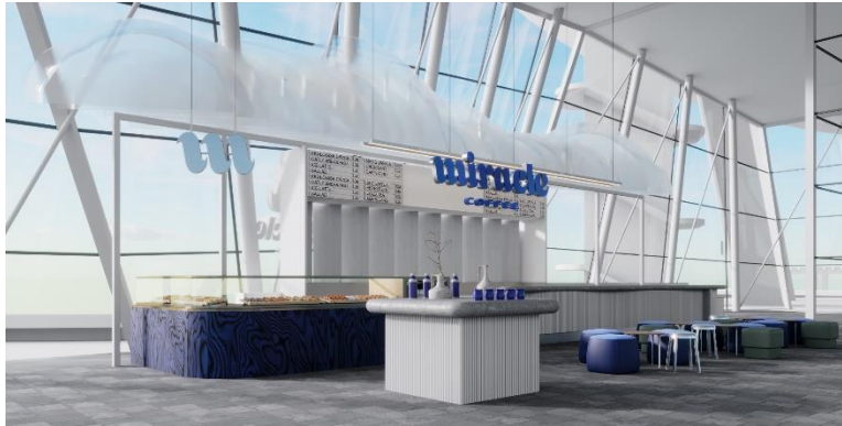
Rendering of Miracle Coffee in the lobby of ArtScience Museum

Miracle Coffee reveals Singapore flagship at lobby of the iconic ArtScience Museum 'The Miracle Lab' series debuts; homegrown coffee roasters collaborate to create special flight from 6 to 10 December with proceeds going to charity