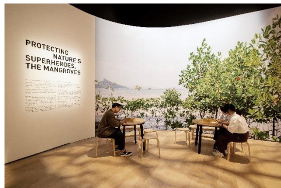
Visitors are encouraged to add their thoughts and stories about the environment to a mangrove tree