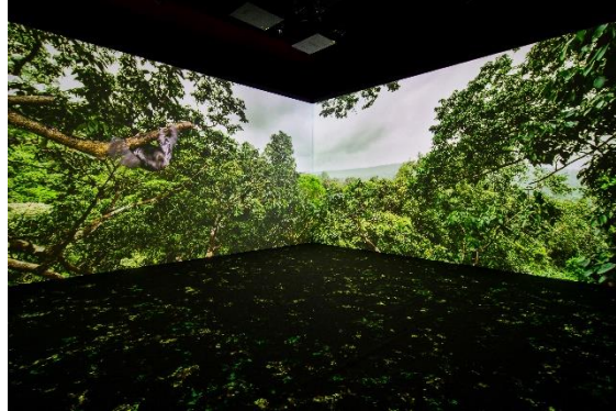
A sloth hanging from a branch is among the many animals of the rainforest that visitors will encounter

Visitors will be whisked away to French Guiana in South America to discover the Earth's oldest living ecosystem – the rainforest. In the midst of the fragrant blooming flowers and scent of damp wood, they will take in panoramic views from the top of the forest canopy 30 metres above ground, before making a slow descent to the forest floor. A diversity of wildlife can be encountered along the way, including centipedes, snakes, a spider, and a sloth hanging from a branch.