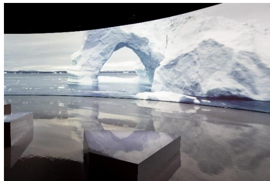
The journey through seven ecosystems ends in Greenland among the breathtaking polar landscapes

Finally, visitors will arrive at the far north of Greenland, where they fly above, navigate across, and plunge underwater amongst breathtaking polar landscapes. Here, visitors will encounter glaciers, fjords, tundra plains, hills, and underwater environments. Despite its seemingly inhabitable conditions, a rich biodiversity of animals appear, including the Arctic fox, Arctic stern, black-legged Kittiwake, seal and humpback whales. Visitors will also witness the effects of climate change and watch as iceberg shards cleave away and plunge into the Arctic waters with loud cracks that pierce through the howling cold wind.