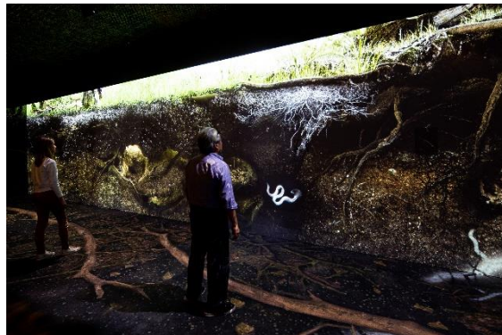
This environment invites visitors deep into the depths of the earth

Visitors will be taken on a journey underground, into the soil of the earth, where almost 25 per cent of all known species of animal and plant reside. Projections of a subterranean landscape reveal tunnels in the soil that are home to a wide variety of living organisms – from tiny bacteria and small animals such as ants, soil mites, earthworms, and springtails, to larger mammals like hedgehogs and moles. Underground connections between plant roots and fungi mycelium will be revealed, highlighting the vital symbiotic relationship that sustains this ecosystem. The gallery