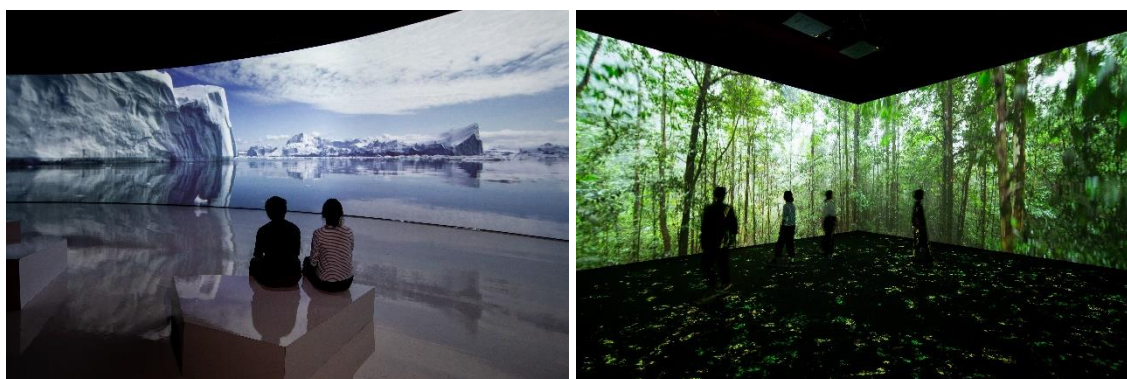
Left: Visitors looking out at the breathtaking polar landscapes in Greenland Right: Visitors can make their descent from the rainforest canopy to the forest floor

New exhibition offers an awe-inspiring journey through seven ecosystems where visitors can see, hear, smell and feel nature like never before