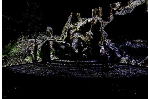
Visitors will be able to experience echolocation through the perspective of bats

Among the nocturnal inhabitants of the temperate forest is the serotine bat. While they are hunting for food, visitors can take to the skies with them and witness the phenomenon of echolocation which manifests through soundwaves that bats use to see in the dark. Visitors will be able to hear, as well as see, how the bats' high-pitched clicks bounce off distant objects to reveal the topography of their surroundings, aiding in their navigation and hunting.