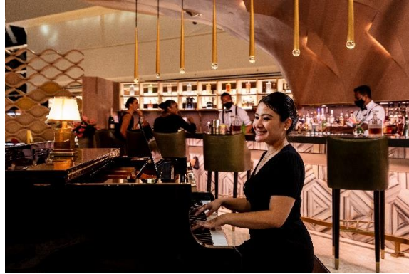
Bask in the joy of the Easter weekend and unwind with live music at Renku Bar & Lounge

Throughout Easter weekend (29 to 31 March), Renku Bar & Lounge will jazz up the celebrations all day with two limited-time mains. Indulge in the lobster eggs benedict (S$32++) with a serving of tangy yuzu marinated herb salad, and Spring lamb rack (S$42++) served with baked new potatoes and caramelised asparagus. Renku has also concocted three themed cocktails (S$24++ per glass) to usher in the festivities, including the White Rabbit – a creative cocktail concoction comprising Nanyang kopi'o liqueur stirred with Chambord and topped with heavy cream, presented in a rock glass with a rim of dark chocolate, raspberry and gold flakes.