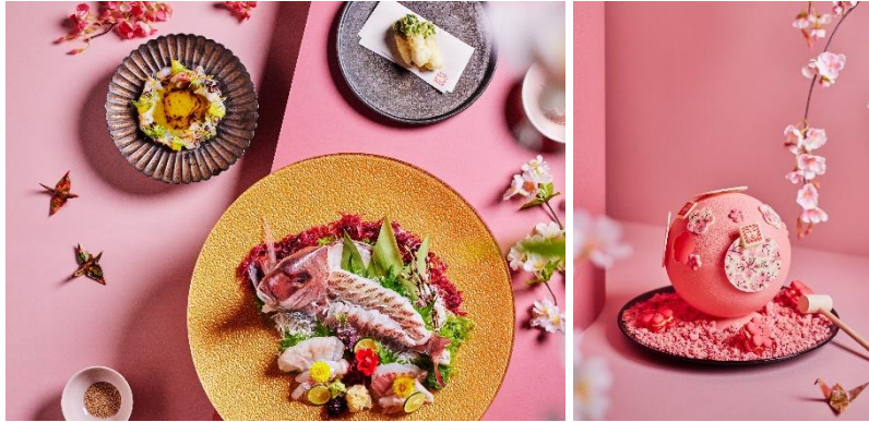
Spring's charm meets Japanese elegance at KOMA (from L to R): sakura 'tai' specials; sakura pavlova

Black Tap also debuts the decadent Cadbury CrazyShake ® (S$24++), featuring a chocolate frosted rim with crumbs of Cadbury Crunchie bar and topped with chocolate covered ice cream, Crunchie bar, whipped cream and chocolate drizzle. An ode to the popular chocolate with golden hokey pokey honeycomb, the Cadbury crème shake is set to conclude the vibrant dining experience on a sweet note till 31 March. For reservations, visit marinabaysands.com/restaurants/blacktap.html .