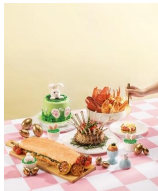
Hop on for an Easter weekend extravaganza at RISE (clockwise from top left): bunny's carrot cake ; seafood on ice ; lobster eggs benedict ; New Zealand saltmarsh lamb rack ; salt crust baked whole sustainable salmon

Unwind at Renku nightly with 'Wine & Cheese with us' , a brand-new evening special that presents guests with a complimentary cheese platter with every first bottle purchased. Renku's wine menu features a selection of bottles from around the world such as the Sartori, Delle Venezie, Italy, Pinot Grigio (S$95++), a light, crisp, fresh and dry white wine with hints of lemon, green apple and blossoms, and the exclusive Marina Bay Sands Grande Reserve, Saint-Emilion, Grand Cru (S$135++), a medium to full-bodied red wine with notes of dark red and black fruits, mocha and spicy oak. For reservations, visit marinabaysands.com/restaurants/renku-bar-and-lounge.html .