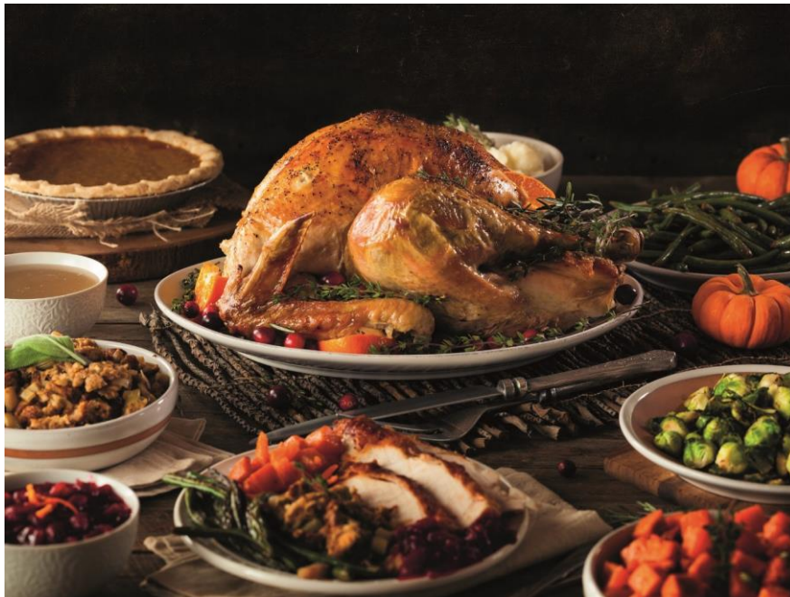
Savour an array of Thanksgiving specials at international buffet restaurant Rise

Perfect for cozy and large group celebrations, international buffet restaurant Rise is set to unveil its signature Thanksgiving spread this festive season. For one-night only on 28 November, enjoy dishes such as the velvety spiced pumpkin veloute and a live station featuring a whole traditional roasted turkey with stuffing and giblets sauce . Other highlights on the menu include fresh Canadian snow crab , moreish hickory smoked barbeque pork ribs , and a whole roasted ribeye carving station . A delightful spread of desserts await, including treats such as the candied pecan tart , apple raisin crumble , and pumpkin pie with whipped cream .