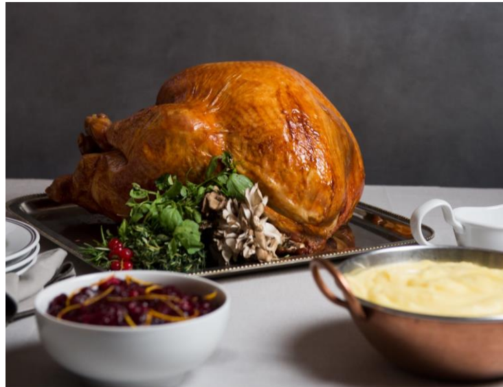
db Bistro & Oyster Bar presents its delicious duo of turkey this Thanksgiving

Celebrate Fall over a splendid feast at db Bistro & Oyster Bar, as the restaurant presents an exclusive three-course menu ($98++ per pax) on 28 November. Whet your appetite with the delicious Hokkaido pumpkin soup , simmered with duck confit, variations of celery and nutty pumpkin seeds. Next, relish in a scrumptious duo of free-range turkey , featuring a combination of herb roasted turkey breast and chipolata sausage stuffed leg, served alongside tasty corn bread, chestnut stuffing, brussels sprouts, spiced cranberry sauce and natural gravy. db Bistro & Oyster Bar also presents guests with a medley of Thanksgiving desserts, including the rustic spiced pumpkin pie with maple bourbon ice cream , the rich chocolate pecan pie with milk chocolate ice cream , and the beautiful Normandy apple pie with vanilla ice cream .