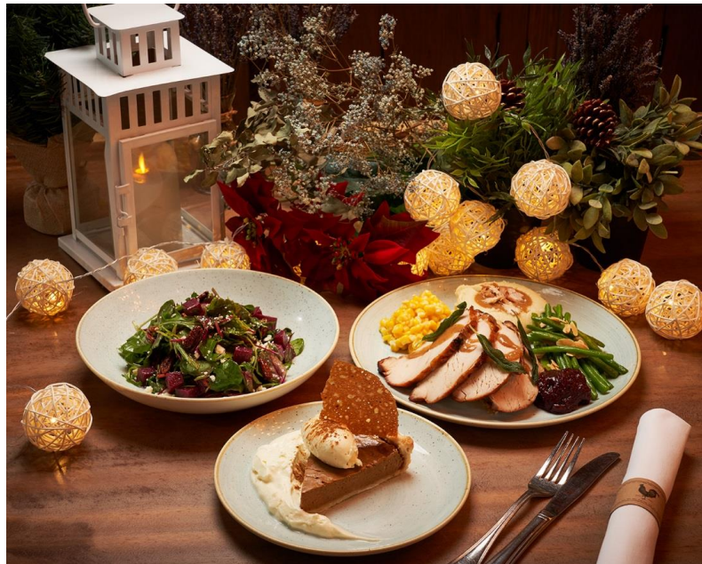
Yardbird's three-course Thanksgiving special (from L to R): beet root, goat cheese and pecan salad, oven roasted turkey, and pumpkin pie

Classic American restaurant Yardbird Southern Table & Bar is celebrating thanksgiving with a seasonal three-course menu (S$58++) on 28 November. Begin with a refreshing starter of beet root, goat cheese and pecan salad , before tucking into a freshly carved oven roasted turkey with rich butternut stuffing, mashed potatoes and turkey gravy, creamed corn, green beans almandine and sweet cranberry sauce. The meal finishes with a rustic pumpkin pie served with chantilly cream.