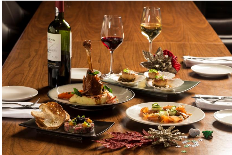
Bread Street Kitchen presents a hearty thanksgiving menu for the season

On 28 and 29 November, Bread Street Kitchen by Gordon Ramsay rolls out a traditional English Thanksgiving feast (S$79++ per pax for three courses; minimum seating of two guests). Begin the celebrations with a deluxe starter board , featuring a medley of seasonal favourites including the Impossible scotch egg doused in remoulade sauce and Welsh rarebit and stuffed mushrooms topped with mulled berries and parsley crumbs. Guests can take their pick from four delicious mains, such as the traditional roasted stuffed turkey breast , and the braised turkey leg , served with champ mashed potatoes, roasted parsnips and crispy pork crackling. Complete the meal with Bread Street Kitchen's delightful dessert platter, featuring an indulgent chocolate fondant with salted caramel and mint chocolate chip ice cream , alongside a tangy blood orange tart with rhubarb sorbet .