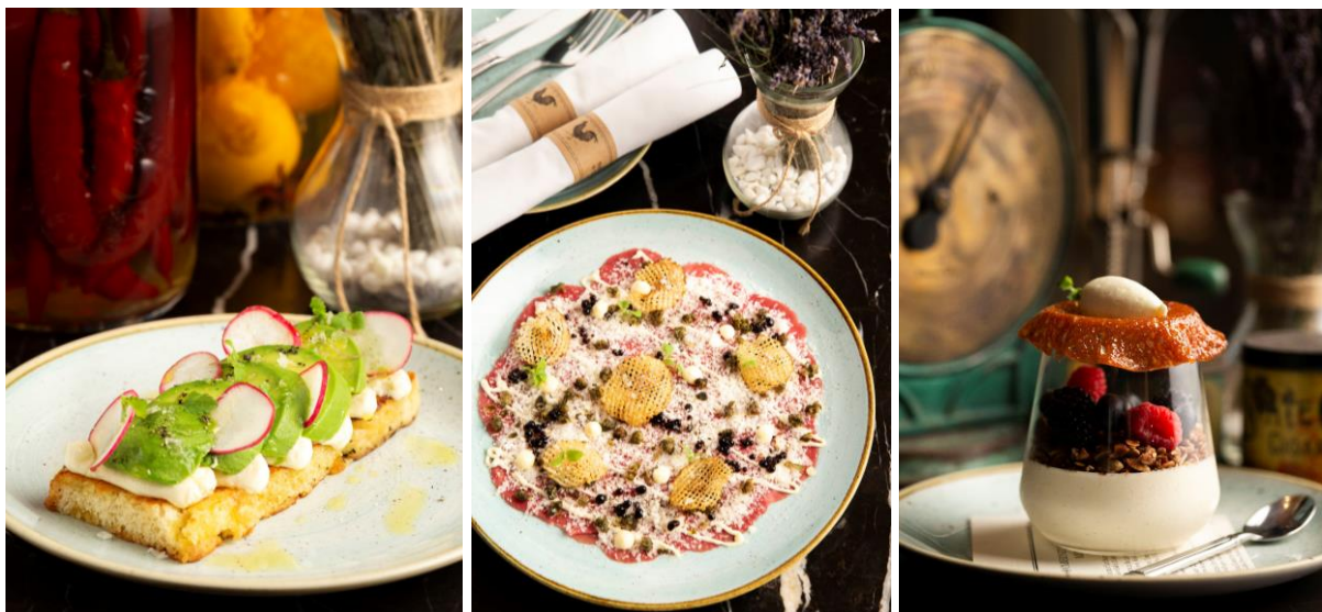
Savour Yardbird's brand new dishes (from L to R): avocado toast, wagyu beef carpaccio, and yogurt & granola panna cotta

Guests can opt for a specially curated course-by-course wine pairing at an additional S$30++, including the bubbly Belstar "Brut" Prosecco from Veneto Italy, Sliding Hill Pinot Noir , Marlborough, 2016 from New Zealand, and Woolshed Moscato 2016 from Victoria Australia.