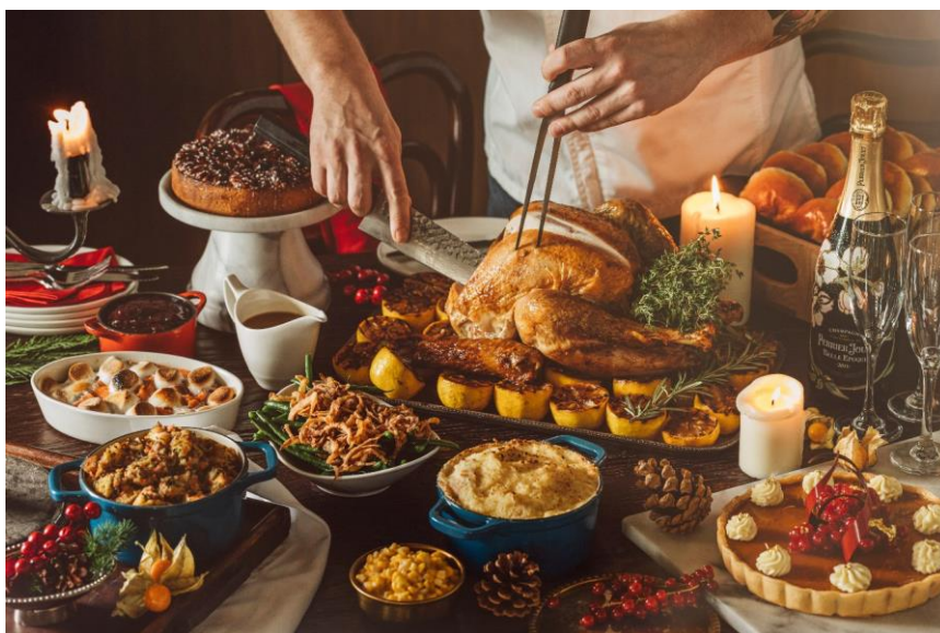
Pamper yourself with a luxurious Thanksgiving spread at LAVO