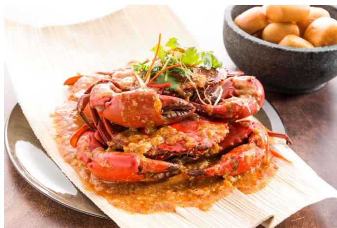
Rise presents the iconic Singapore Chilli Crab

Jazz up the National Day celebrations at The Bird Southern Table & Bar , as the classic American restaurant and bar ushers in Singapore's 53 rd birthday with live music. Groove to the beats and savour the restaurant's newest Lobster Mac and Cheese , featuring a whole lobster with five cheese mornay and a herb crust. Pair the meal with a glass of The Bird's specialty cocktail such as the Southern Peach or The Bird Old Fashioned for an afternoon respite. For reservations, please email TheBird.Reservations@marinabaysands.com or call +65 6688 9959.