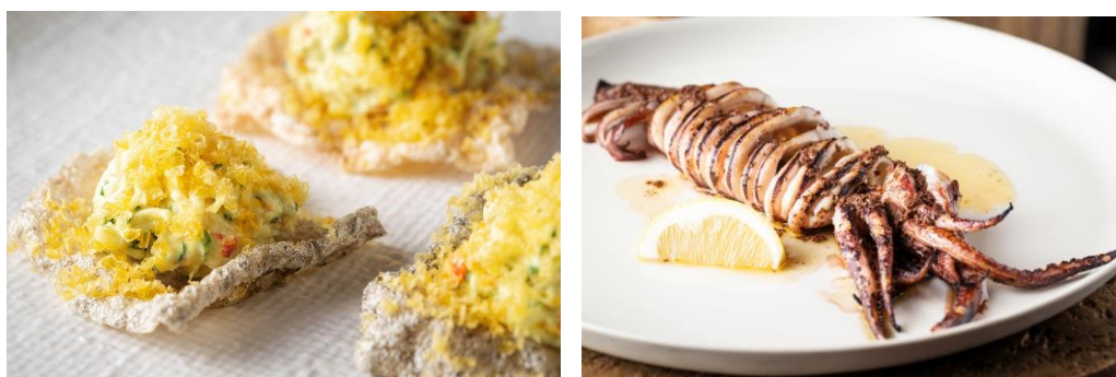
Enjoy delightful sharing plates at Adrift on National Day with the (from L to R): King Crab Slaw with fish crisps and jalapenos , and Japanese Flying Squid with white soy dressing

Celebrate National Day at Adrift by David Myers over light bites and barbeque sharing plates. Available from 12pm till late, the one-day only special menu include highlights such as King Crab Slaw with fish crisps and jalapenos , and Japanese Flying Squid with white soy dressing . Adrift will also be serving up one-for-one Singapore Sling (S$23++), a perfect cocktail to pair with the savoury plates. For reservations, please email Adrift.Reservations@MarinaBaySands.com or call +65 6688 5657.