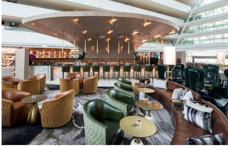
Toast to a refreshing glass of green tea infused Renku Lager over tantalizing satays

Renku Bar & Lounge commemorates National Day with a Beer and Satay set (S$25++), available throughout the month of August. Savour half a dozen freshly-grilled satays alongside a glass of the signature Renku Lager , a refreshing green tea infused lager that is silky smooth on the palate. All Afternoon High Tea guests will also take home an assorted selection of locally inspired tea blends samples, such as the aromatic Nasi Lemak and exclusive Durian Lapis . For reservations, please email Renku.Lounge@MarinaBaySands.com or call +65 6688 5535.