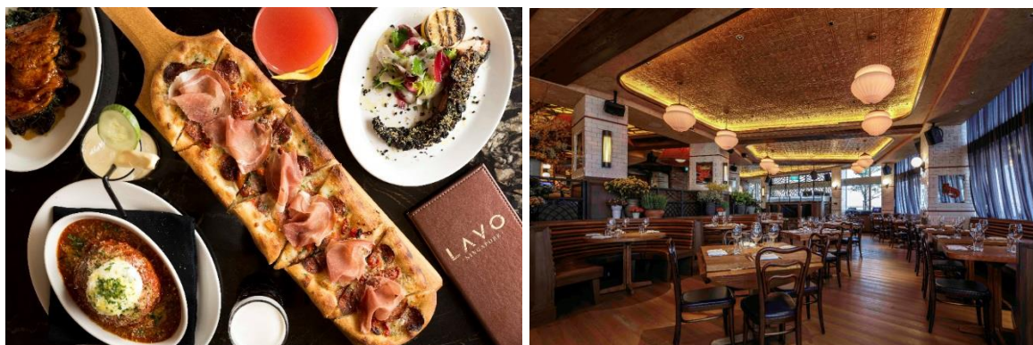
LAVO Singapore recently launched its weekend brunch series where diners can take in spectacular views 57 stories above ground

Fans of LAVO can now visit the Italian rooftop bar and restaurant on weekends to enjoy an unforgettable brunch experience set 57 stories above ground in the skies. From 10.30am to 3.30pm on Saturdays and Sundays, LAVO Singapore will present the best of its signature