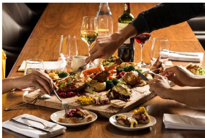
Enjoy a British Thanksgiving feast at Bread Street Kitchen & Bar

This Thanksgiving, relish in a decadent medley of dishes at Bread Street Kitchen with its three-course Thanksgiving menu (S$79++ per person). Begin the hearty spread with a starter of Brie stuffed Portobello mushrooms with walnut pesto and berry compote , before savouring a platter of Traditional roasted turkey and beef striploin, with pigs in blanket, a side of Yorkshire pudding, roasted potatoes, brussels sprouts, glazed carrots, cranberry and gravy . End the feast with a luscious Pumpkin and pecan nuts pie with clotted cream . The Thanksgiving menu is available from 22 to 25 November for both lunch and dinner service, and will be served as sharing plates (minimum 2 persons).