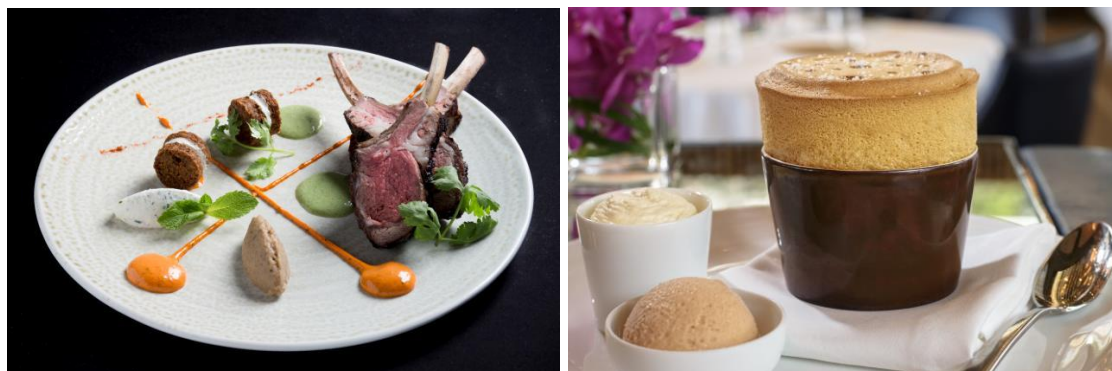
Savour the best of Spago's award-winning cuisine (from L to R): Grilled Colorado Lamb Chops and Salted Caramel Soufflé

Celebrity chef restaurant Spago by Wolfgang Puck presents a four-course Christmas Eve menu (S$195++), featuring its signature Kaya Toast , a reinvention of the Singapore classic local breakfast, alongside dishes such as USDA Prime Côte de Boeuf for Two with a side of Aligot Potatoes, Roasted Bone marrow and Black Truffles , and Colorado Lamb "Ribeye" with Caramelized Heirloom Carrots, Eggplant Caviar, Tzatziki, Marcona Almonds and Parmesan Polenta . Dessert lovers will delight in Spago's signature Salted Caramel Soufflé with Farmer's Market Fuji Apple Sorbet .