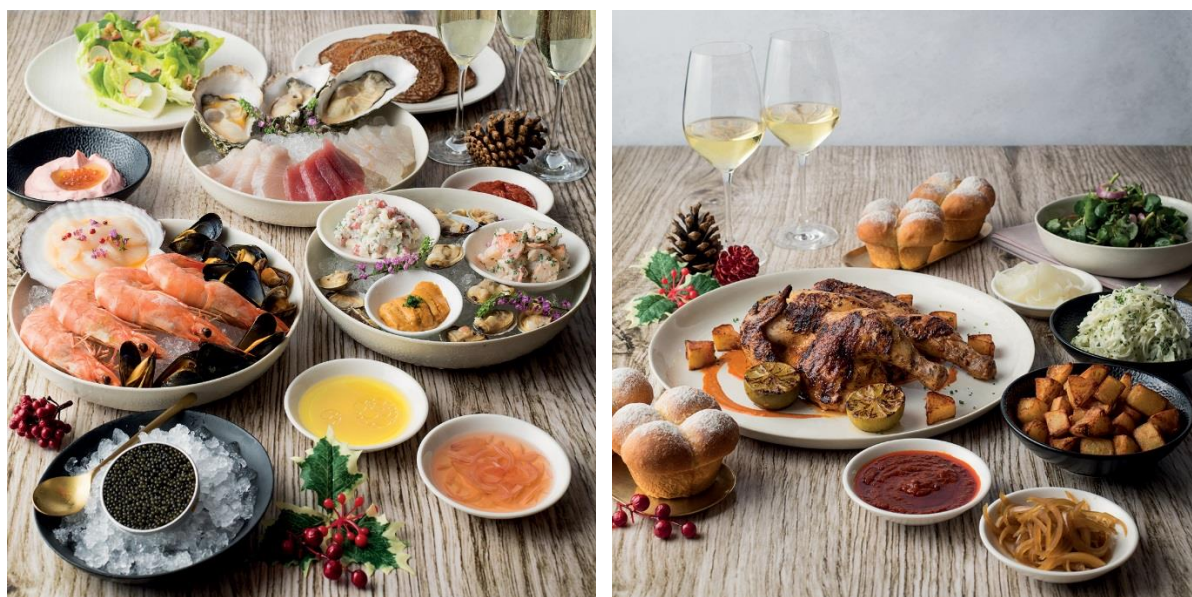
Adrift offers two sharing platters (from L to R): the Grand Plateau Seafood Platter and the Smoked Peri Peri Chicken Platter , perfect for a group gathering

Adrift by David Myers presents an exquisite feast this holiday season. Dive into a hearty seafood spread and indulge in the Grand Plateau Seafood Platter (S$128++), featuring fresh seafood such as Alaskan King Crab Leg, Hokkaido Sea Urchin, Big Eye Tuna, French Mussels and langoustine. Elevate the experience with an additional topping of caviar (from S$98++ for 30 grams) or pop a bottle of champagne (from S$180 per bottle). Guests can also spice up the holiday season with Smoked Peri Peri Chicken Platter (S$88++), a sizzling feast featuring a wood-fired Peri Peri Chicken and an array of sides such as Sherry Vinegar Watercress Salad, Shredded Mustard Leaf Cabbage Salad and Peri Peri Spiced Potato Frits. Brined in spice and citrus, this whole bird is smoked and barbecued to perfection before it is glazed in a special hot sauce. The platters are available for the whole month of December.