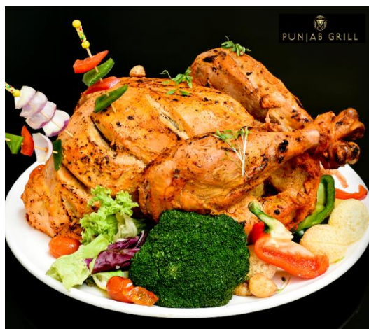
Spice up your family feasts with Punjab Grill's Tandoori Turkey

complimentary admission to Digital Light Canvas . For more information, please visit https://www.marinabaysands.com/entertainment/digital-light-canvas.html .