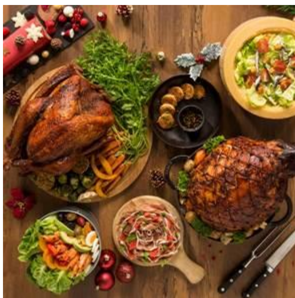
Rise offers a spread of classic festive offerings and seafood specials for the year-end celebrations

From 10 to 25 December, savour a spread of festive favourites at Rise at Marina Bay Sands, as the restaurant presents an array of cold plates, festive selections, and sweet treats. Gather your loved ones and indulge in a luxurious Christmas dinner featuring Roasted Australia Wagyu Hip with Onion Gravy & Yorkshire Pudding and Traditional Roasted Turkey with Stuffing and Giblets Sauce , alongside unlimited servings of fresh Whole Tuna, Hamachi, Lobster & Alaskan King Crab . Live stations will serve Pan Seared Hokkaido Scallop with Braised Leek & Potato & Black Truffle Shaving and Pan Seared Foie Gras with White Peach, Brioche & Balsamico Reduction .