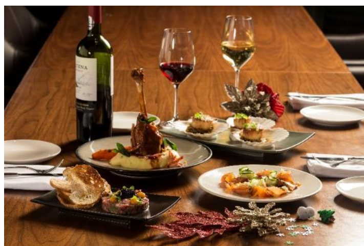
Bread Street Kitchen and Bar presents a three-course Festive Season Menu

This Thanksgiving, relish in a decadent medley of dishes at Bread Street Kitchen with its three-course Thanksgiving menu (S$79++ per person). Begin the hearty spread with a starter of Brie stuffed Portobello mushrooms with walnut pesto and berry compote , before savouring a platter of Traditional roasted turkey and beef striploin, with pigs in blanket, a side of Yorkshire pudding, roasted potatoes, brussels sprouts, glazed carrots, cranberry and gravy . End the feast with a luscious Pumpkin and pecan nuts pie with clotted cream . The Thanksgiving menu is available from 22 to 25 November for both lunch and dinner service, and will be served as sharing plates (minimum 2 persons).