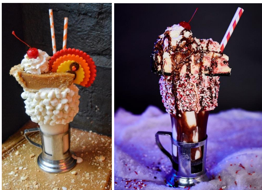
Celebrate the festive season with a visual feast (from L to R): Thanksgiving Shake and Holiday Shake

Indulge in gratifying sweet treats at Black Tap Craft Burgers and Beer as the restaurant rolls out two festive-themed CrazyShakes for the year-end celebrations. Exclusively available from 19 to 22 November, the pumpkin-based Thanksgiving Shake (S$22++) features a vanilla frosted rim with mini marshmallows, and is topped with a slice of creamy pumpkin pie, a turkey marzipan lollipop, swirls of whipped cream, and a Maraschino cherry.