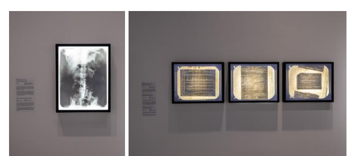
L to R: The x-ray shows where screws and a rod were inserted into Frida's lower back to support her spine; Frida's inpatient vitals chart tracked her body temperature, pulse and breathing rate; this report details her condition before and after the amputation of her lower right leg; pre- and post- operation report documenting her right leg amputation

This exhibition features works from Cristina Kahlo Alcalá's personal collection which are being shown outside of the USA for the first time. They include Frida's medical documents and photographs, an x-ray of the artist's spine taken three months before her passing on 13 July 1954, and clinical datasheets that record her health condition in the lead-up to her last major recorded surgery – the amputation of her lower right leg in 1953 due to gangrene.