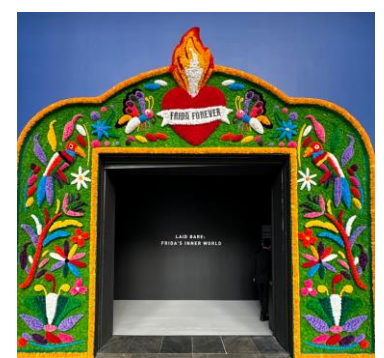
This flower arch is located outside Laid Bare: Frida's Inner World