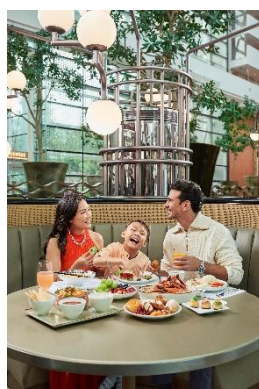
Make a delicious pit stop with the family with a special weekend brunch at RISE

Families are invited to immerse in the race-themed fun at RISE and Origin + Bloom