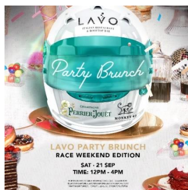
LAVO Party Brunch: Race Weekend Edition returns on 21 September

Gear up at noon with LAVO Party Brunch: Race Weekend Edition (21 September, 12pm – 4pm)