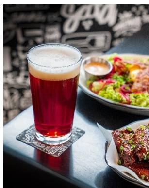
Black Tap spotlights the month-long special Lion Brewery Rosella Lager as well as happy hour from 9pm to midnight during the race weekend

Indulge your senses with special menus and pop-up bars across the property