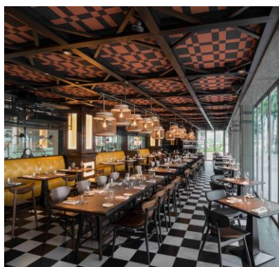
Celebrate the weekend in style with an exclusive brunch experience and free-flow champagne at Bread Street Kitchen & Bar

The unique brew featuring rosé aromas tinged with jasmine blossoms will also be available throughout the month, making it the perfect pairing with The Chairman Burger (S$28++) from 2 to 30 September. The savoury craft burger combines prime beef, topped with melted provolone cheese, mortadella, olive giardiniera, roasted garlic aioli and parsley. For reservations, visit marinabaysands.com/restaurants/black-tap.html .