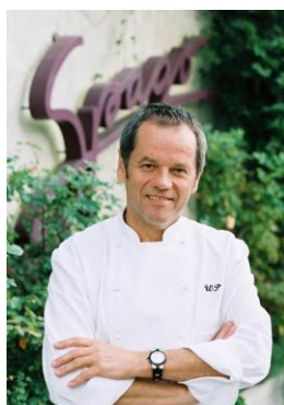
A Night with Wolfgang: A Culinary Retrospective will feature a curated menu showcasing chef Wolfgang's classic and timeless dishes alongside his cherished childhood favourites