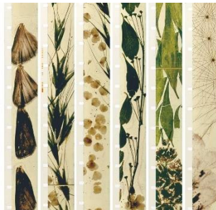
Mothlight (1963) by Stan Brakhage

Organised into two sections, Altered States begins with a short overview of historical examples of material experiments in analogue film, featuring the groundbreaking work of legendary filmmakers like Stan Brakhage and Len Lye and other prominent artists. It includes rarely seen footage and close-ups of scanned analogue film strips that set the stage for the more immersive visual experiences in the next part of the exhibition.