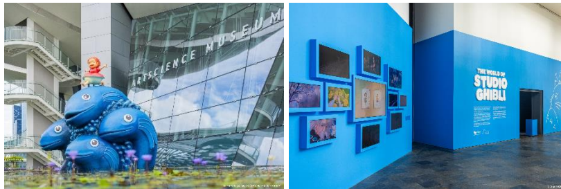
L to R: Visitors will be greeted by a sculpture from Ponyo on the Cliff by the Sea (2008) placed within ArtScience Museum's lily pond; entrance to The World of Studio Ghibli exhibition at Basement 2 of the museum

The exhibition marks the Studio's first official showcase in Singapore