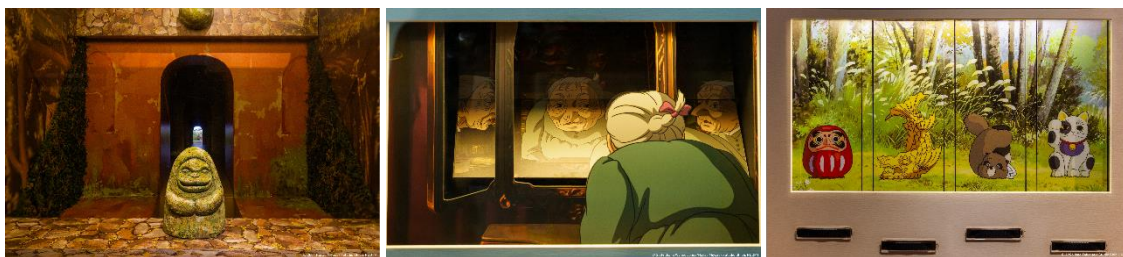
L to R: A variety of box art installations which offer a closer look at scenes including the ominous tunnel guarded by the stone statue in Spirited Away (2001) and old Sophie catching her reflection in the mirror. Some of them are also interactive, such as one where visitors can spin wheels to see the Tanuki from Pom Poko (1994) shapeshift

The exhibition offers numerous opportunities for fans to step into their favourite scenes and be transported directly into Studio Ghibli's dazzling adventures and captivating worlds. Visitors are invited to wander through the lush forest of Princess Mononoke , explore Howl's castle, venture down a grassy tunnel to Totoro's cave, become a customer of Gütikiipänjä bakery where Kiki and her cat Jiji work, hop on a train with No-Face and wait in the rain with Totoro.