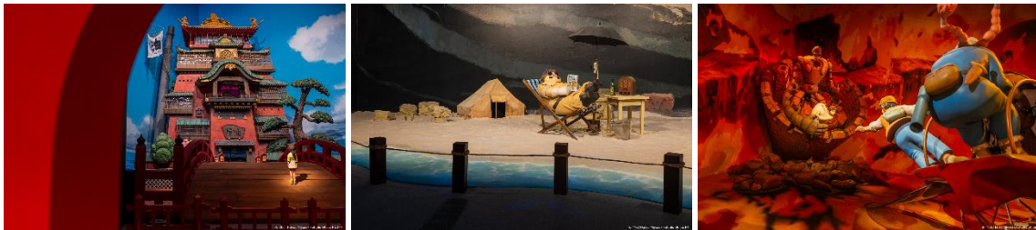
L to R: Some of the large-scale installations recreate memorable scenes such as Chihiro standing in front of the bathhouse in Spirited Away (2001), Porco Rosso's remote island hideout in Porco Rosso (1992), and Pazu rescuing Sheeta in Castle in the Sky (1986)

Upon arrival at ArtScience Museum, visitors will be greeted by a giant sculpture from Ponyo on the Cliff by the Sea (2008) placed dramatically within the museum's lily pond. The journey continues at the Basement 2 galleries with striking immersive installations depicting scenes from Howl's Moving Castle (2004), Castle in the Sky (1986) and My Neighbour Totoro (1988). Meanwhile, the Level 3 galleries feature more original sculptures and theatrical sets from beloved films including Nausicaä of the Valley of the Wind (1984), Porco Rosso (1992), Pom Poko (1994), Princess Mononoke (1997), Kiki's Delivery Service (1989), Spirited Away (2001), and The Boy and the Heron (2023).